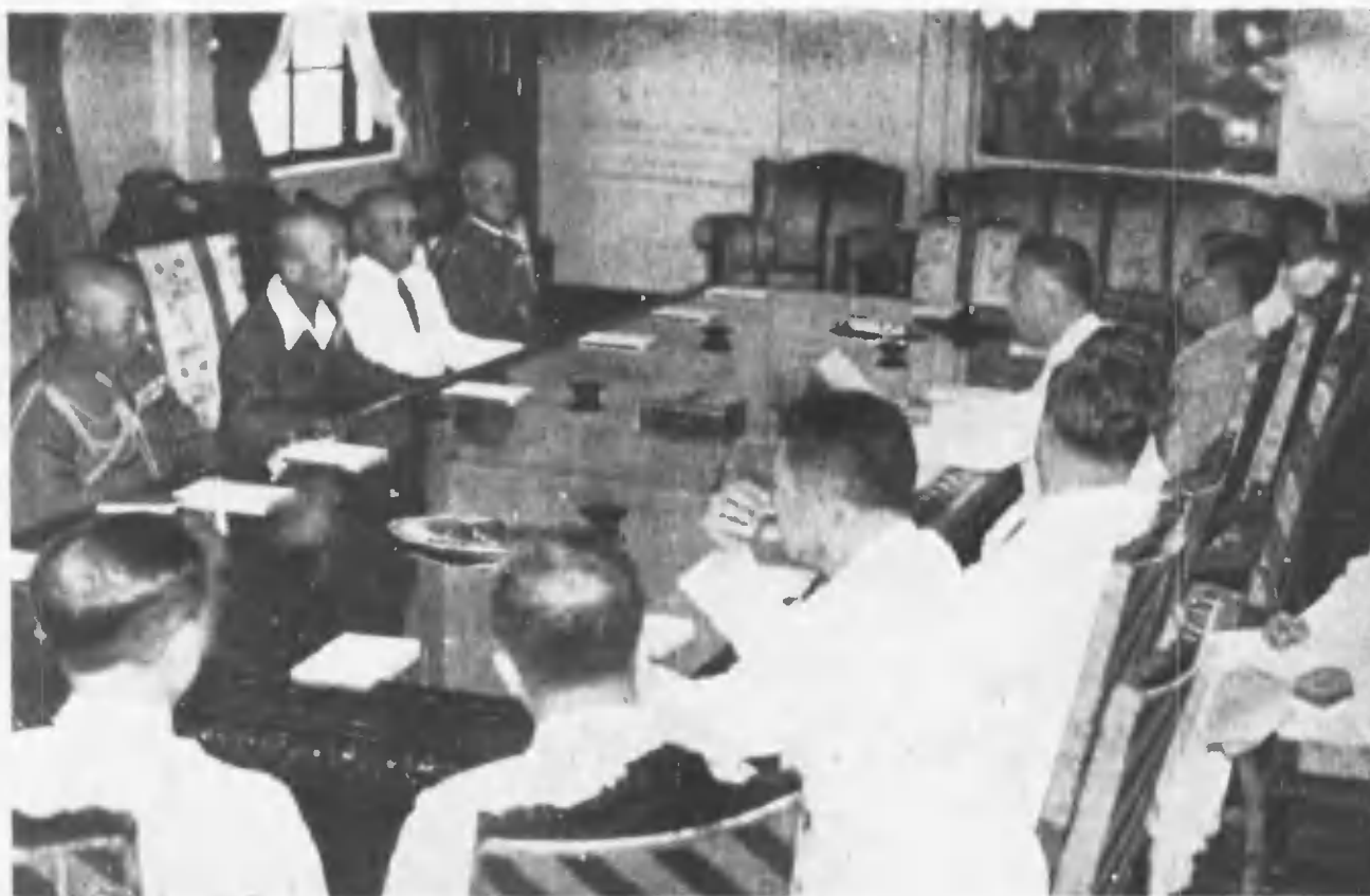
新最高指揮官閣下ノ比島行政府初度巡視 六月一日 (於比島行政府)