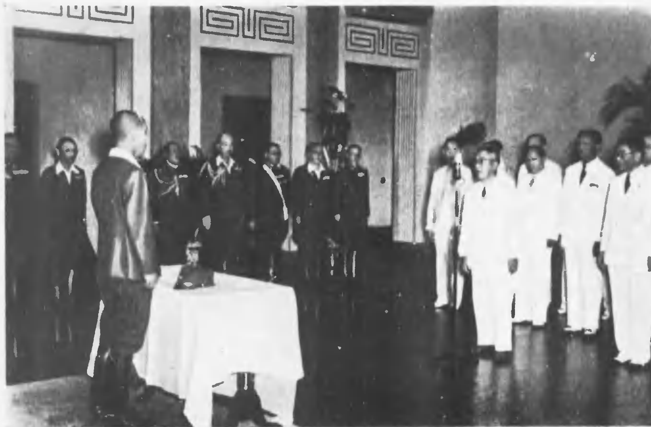
PCPI APPOINTMENT CEREMONY AT KAIKO-SYA—

On June 20 the Highest Commander of the Japanese Army in the Philippines ordered the KALIBAPI to form a preparatory committee for Philippine Independence. Photo shows Lieutenant-General Signori Kuroda, Highest Commander of the Imperial Japanese Army, at the ceremony marking the formal appointment of the PCPI members.