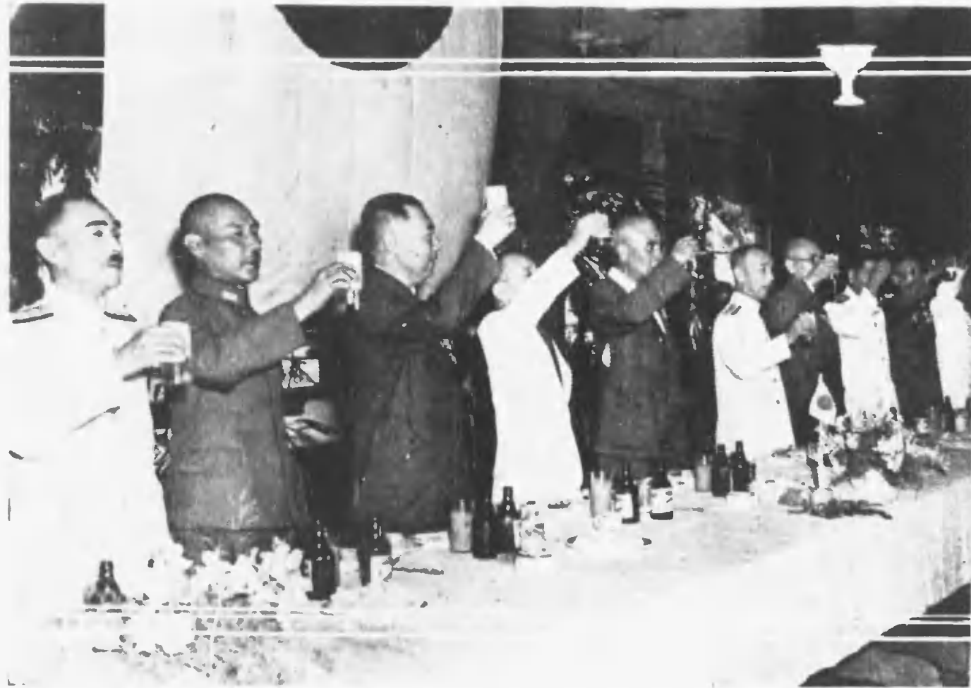
Lieutenant General Masaharu Honma, Commander-in-Chief of the Imperial Japanese Forces in the Philippines, offering a toast to His Imperial Majesty, the Emperor of Japan, at the luncheon which he gave on April 29, 1942, at the Manila Hotel. Ranking officers of the Japanese Army and Navy were invited.

今次聖戰初ノ天長節ノ佳節ヲ迎ヘ聖壽萬歳ヲ慶祝乾杯ス ル本間軍司令官閣下以下陸海軍代表等